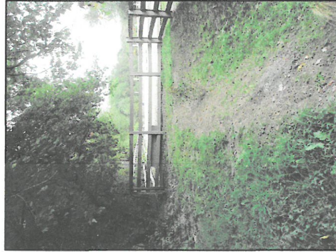
FIGURE 2. - VIEW OF PLANTINGS AND RELOCATED FENCE FACING SOUTH