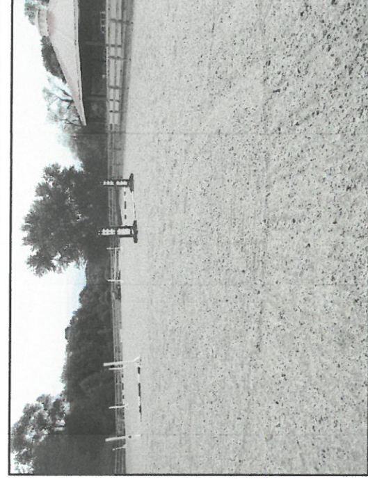
FIGURE 3. - VIEW OF RESURFACED RIDING RING FACING SOUTH.