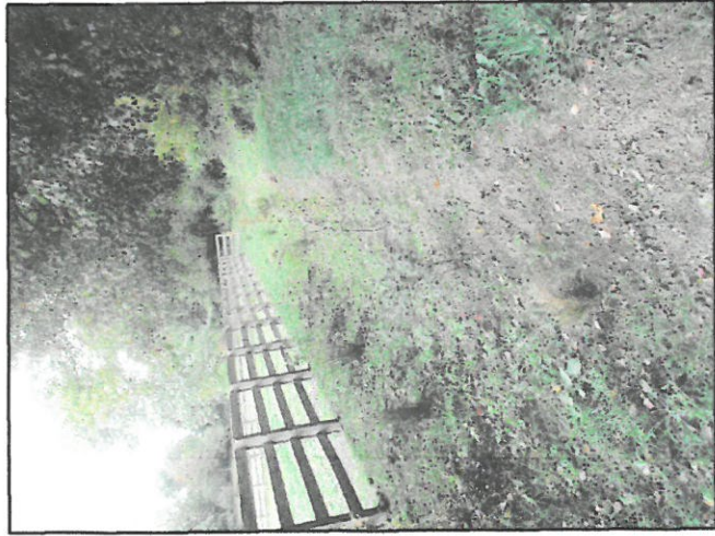
FIGURE 1. - VIEW OF PLANTINGS AND RELOCATED FENCE AREA FACING NORTH.